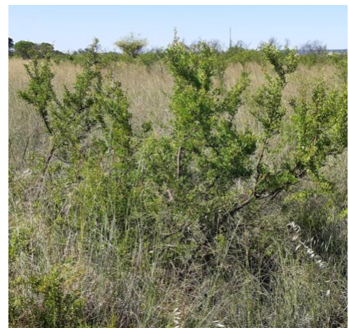
Fig. 1. African lovegrass impacting a population of the endangered Grevillea curviloba

We set up a repeated measures 'before-after-control-impact' experiment near Bullsbrook with replicate sets of 10 × 10m plots of three treatments; a no herbicide control, and a lower (1.5mL L -1 ) and higher (3.0mL L -1 – label rate) flupropanate application rate. We measured cover and health (alive/dead) of plant species before and after an initial and then a follow-up application of liquid flupropanate to African lovegrass foliage. Co-occurring plant species were aggregated into functional groups based on life form and status as native or weedy (native woody shrubs, native perennial groundcovers, invasive perennial groundcovers and invasive annuals) for statistical analysis. Three potentially 'sacrificial' individuals of G. curviloba growing on a recurrently slashed road verge were deliberately sprayed with 3.0mL L -1 flupropanate and monitored periodically for 24 months.